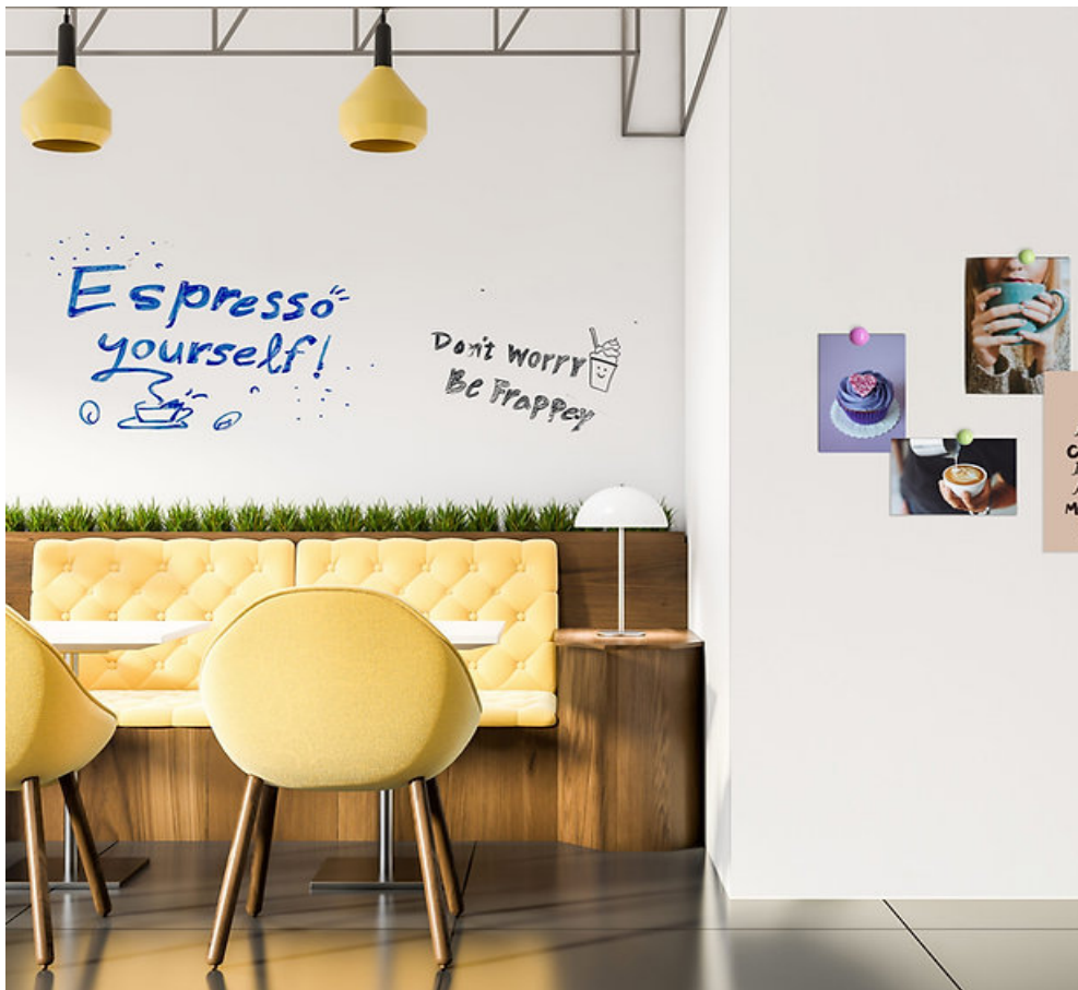
MAGNETIC SOLUTIONS 60" · WWMS-001