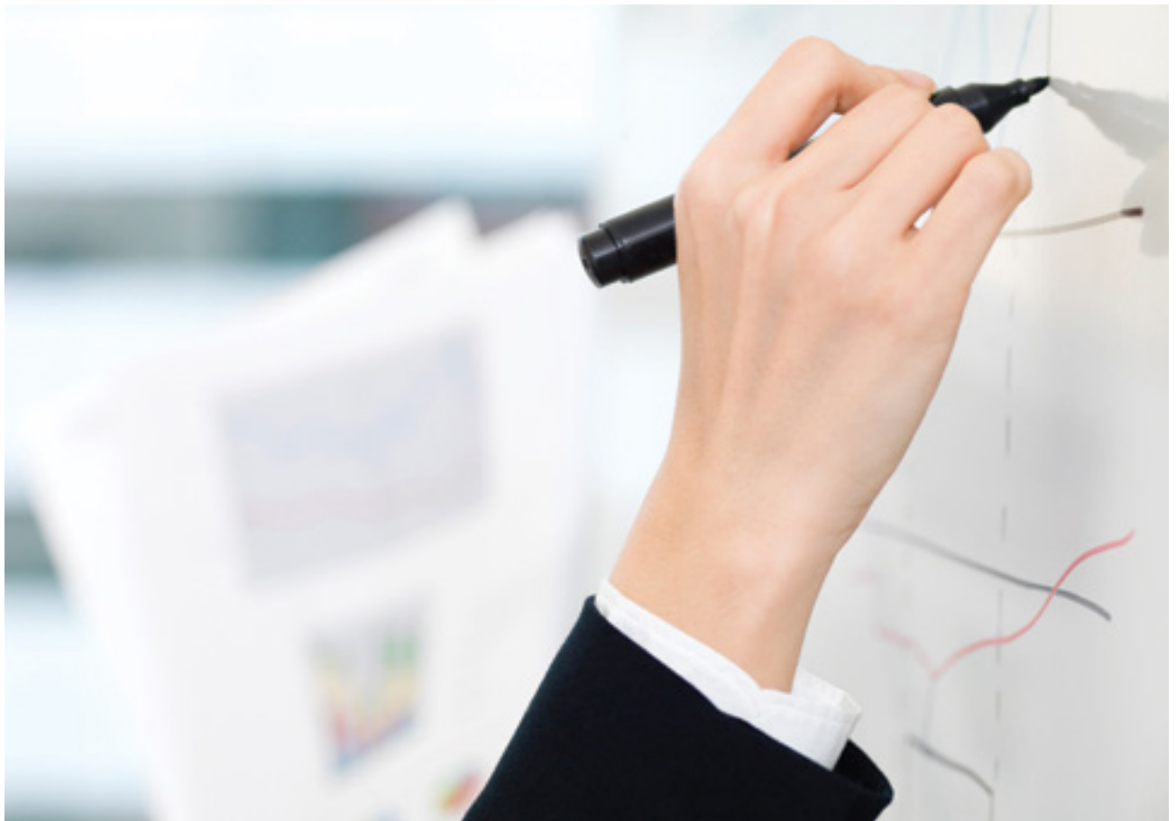
WriteLITE - WWWL-WHITE