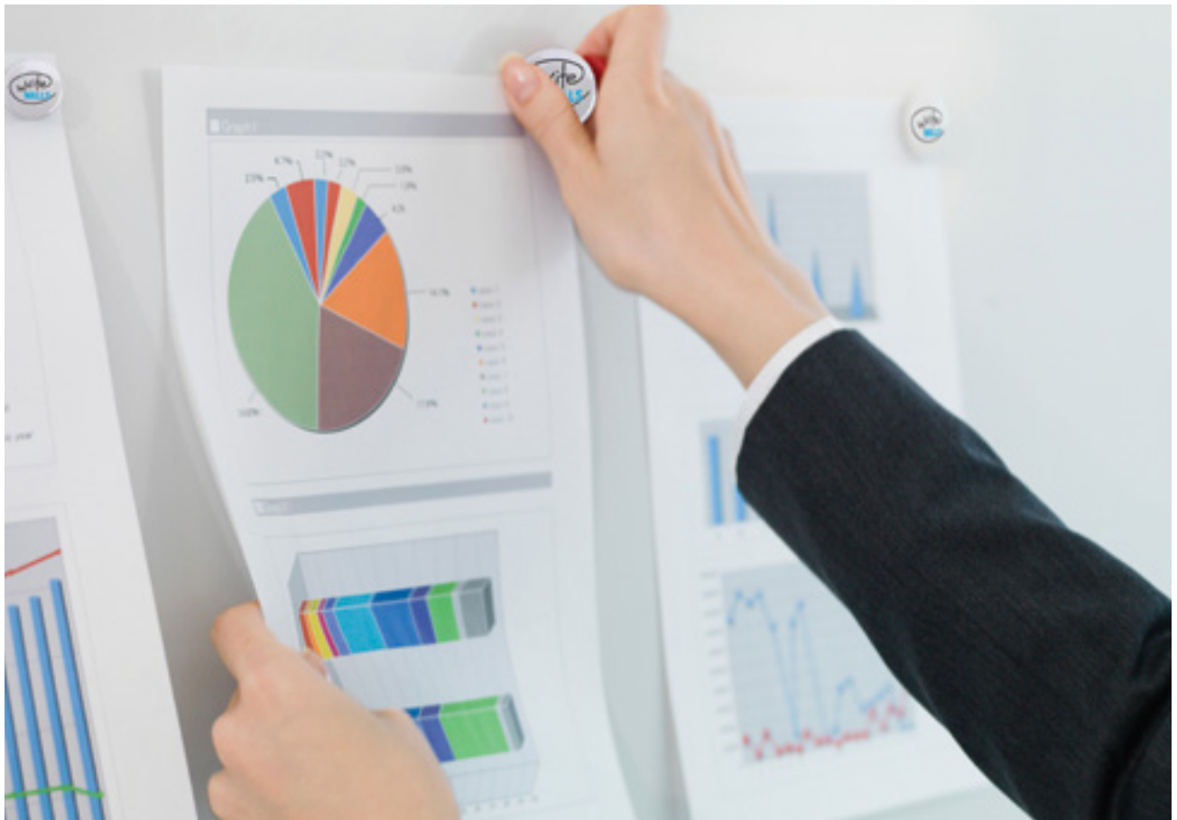
WriteMAGNETIC48 · WWMAG-WHITE