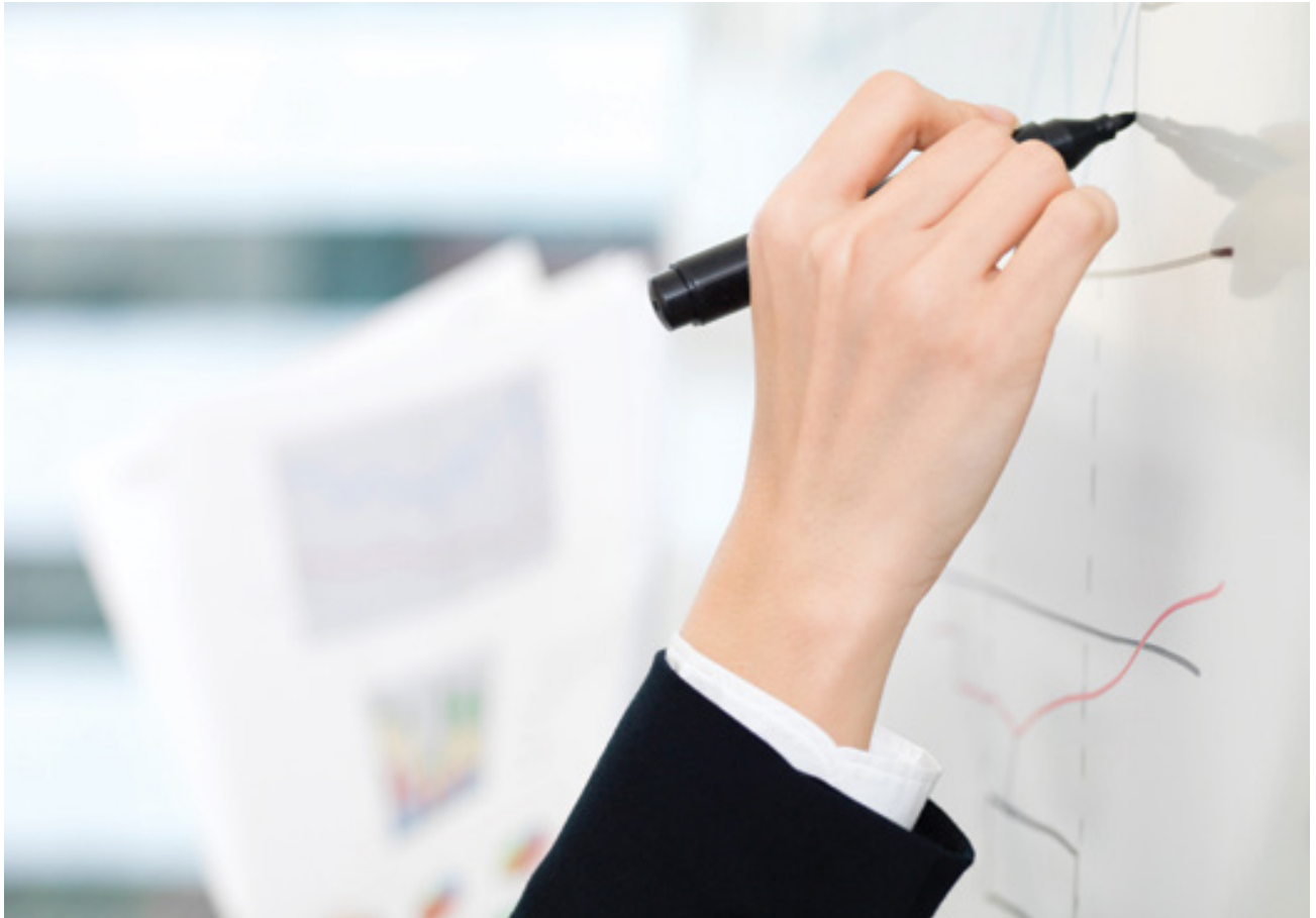
WriteNOW White · WWWD-WHITE