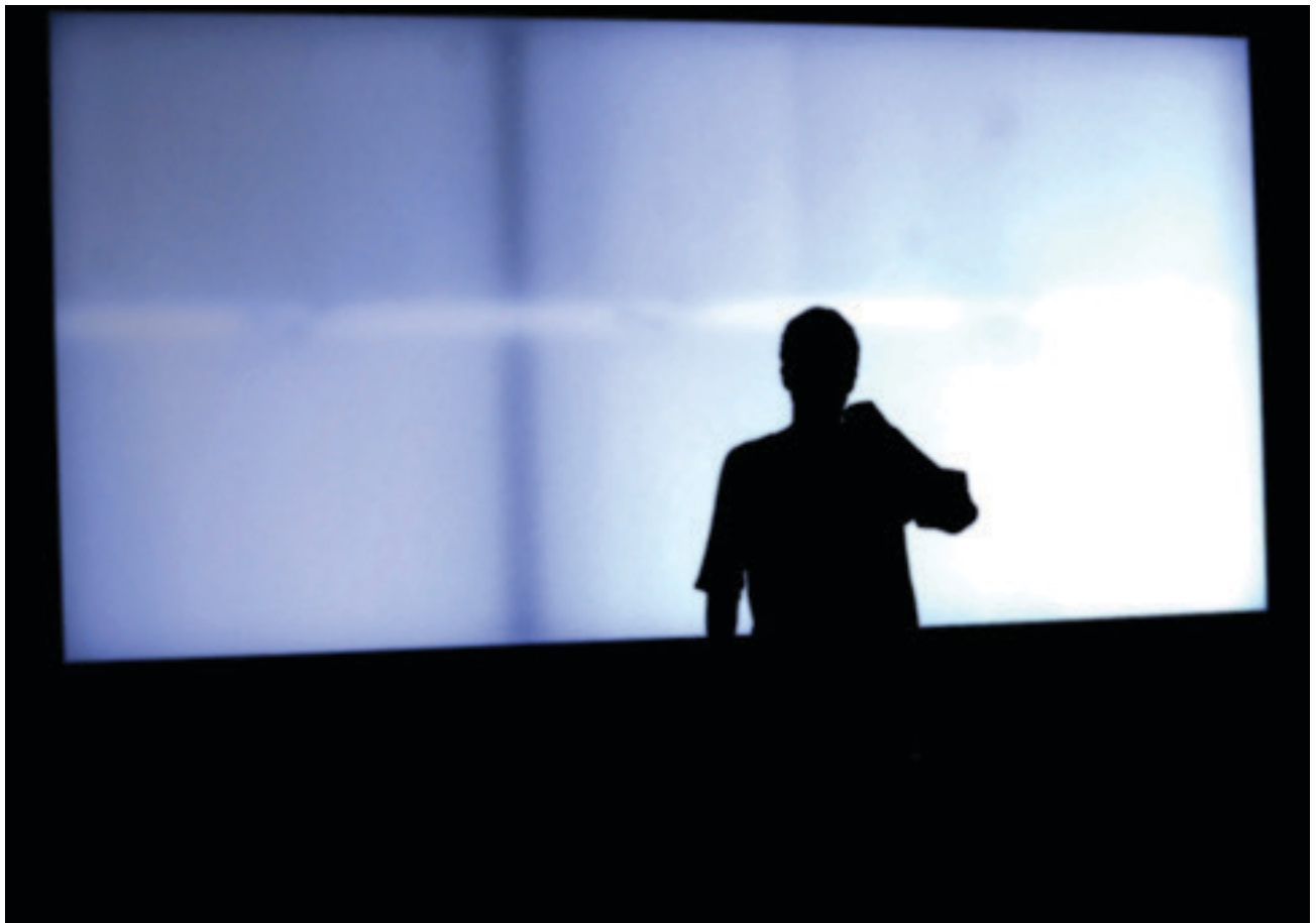
WritePROJECTION · WWPC-MAG-WHITE