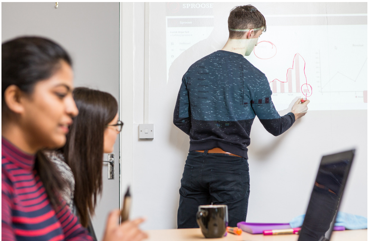
everProject60 • EV-EP-60