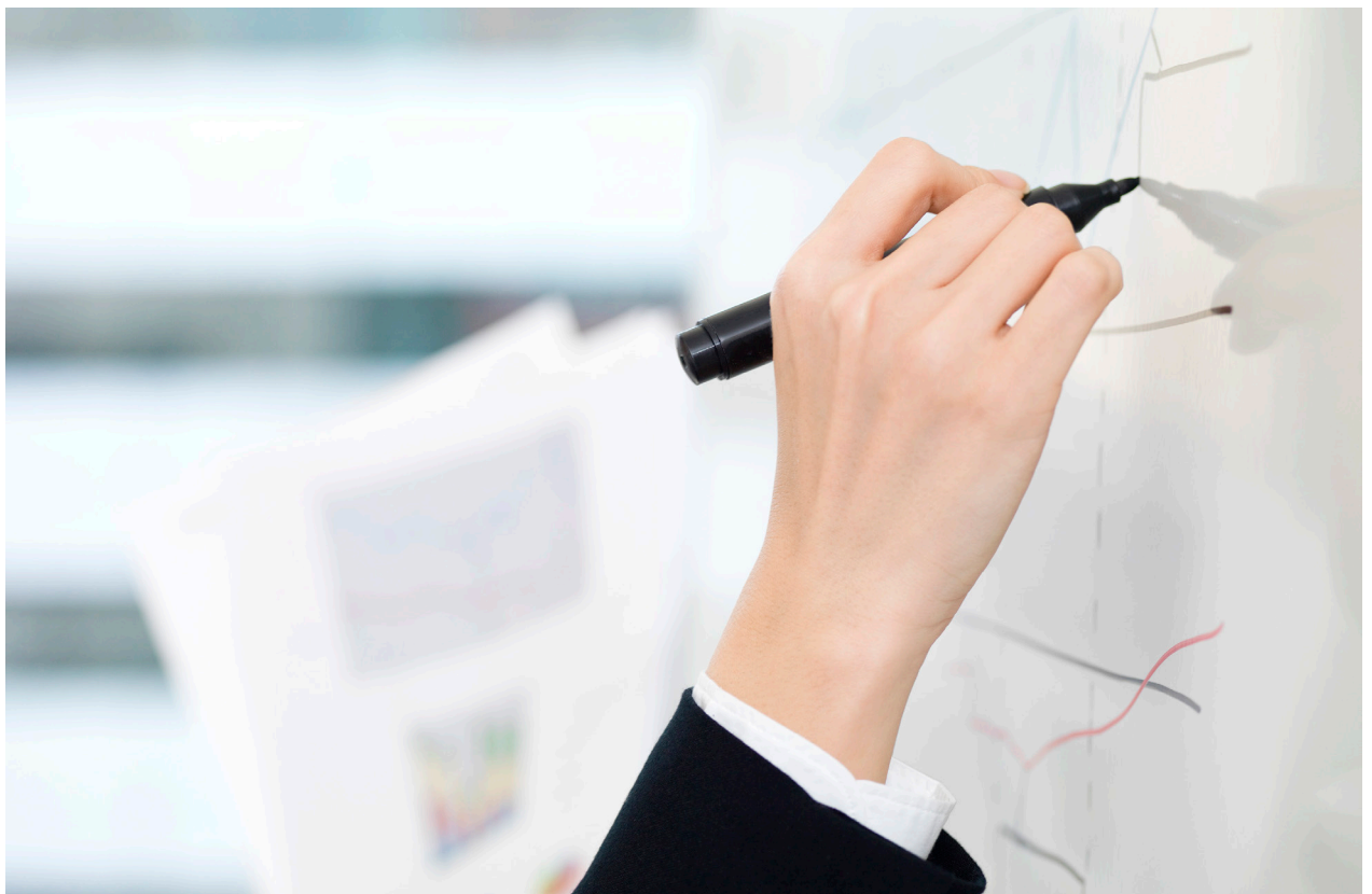
everWrite • EV-EW-60